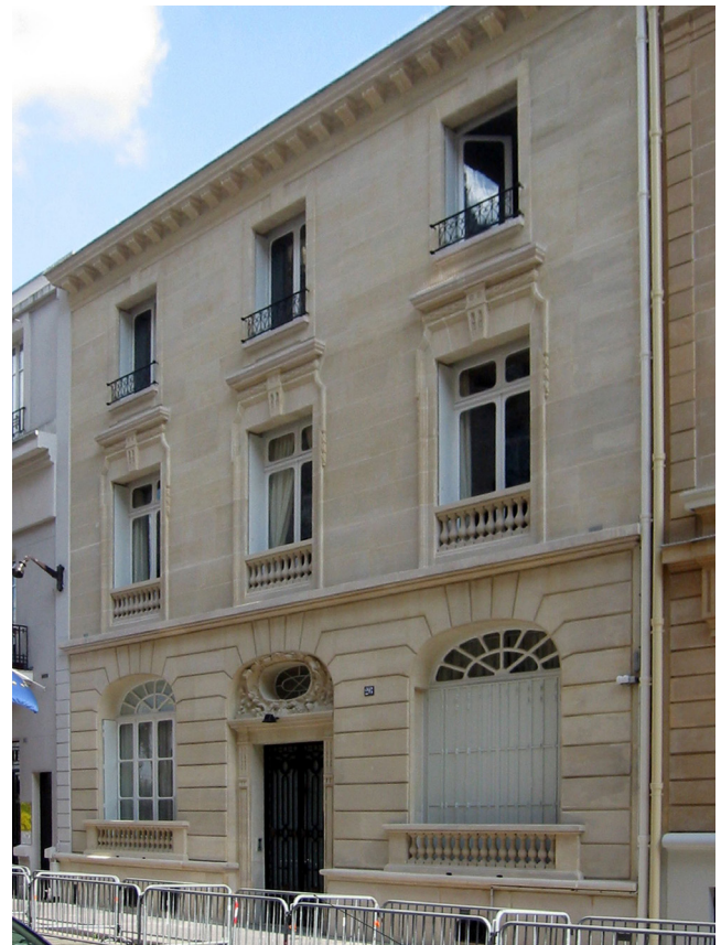
N°26, Facade restauration

Call for tender Surface: 600 m 2 Const. time: 6 months Client: German Embassy Location: 13/15 av F. D. Roosevelt F-75008 Paris Programme: Renovation of a town house Mission: Design, tender, construction supervision