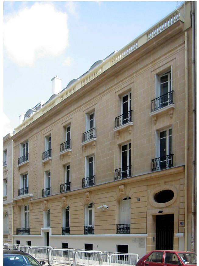
N°24, Facade restauration