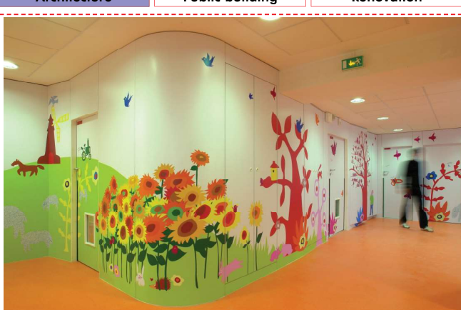
View towards the entry zone

The spaces to be converted are situated on the ground floor in the town hall of the 10th district of Paris, at the angle of the streets Hittorf and Pierre Bullet. The program included the design of a childcare centre for 30 children on a surface of 410 m<sup>2</sup>. To benefit from the natural light which penetrates through the windows along the street Pierre Bullet, it was decided to install the children's play rooms along this wall. The rooms, that do not require daylight, are situated in the darker sections at the back of the building. There is a continuous image wall running along the entire length of the room between functional spaces and the accessible spaces for the children. This screen is decorated by a mural image which incorporates a fun element into the childcare centre. Realized by a graphic designer, it represents nature to compensate for the lack of an outdoors area.