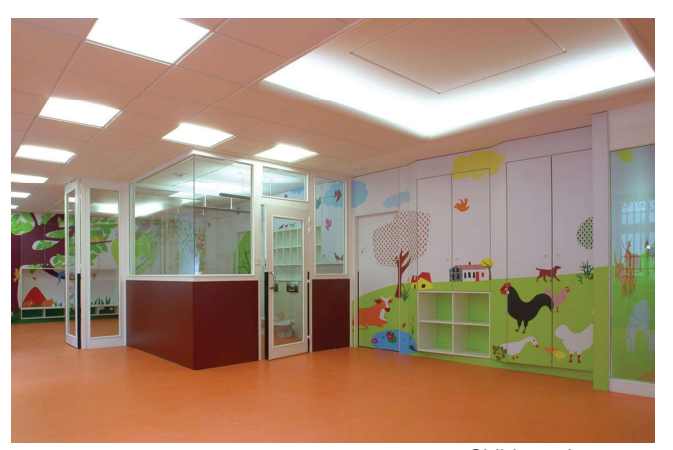
Children play room