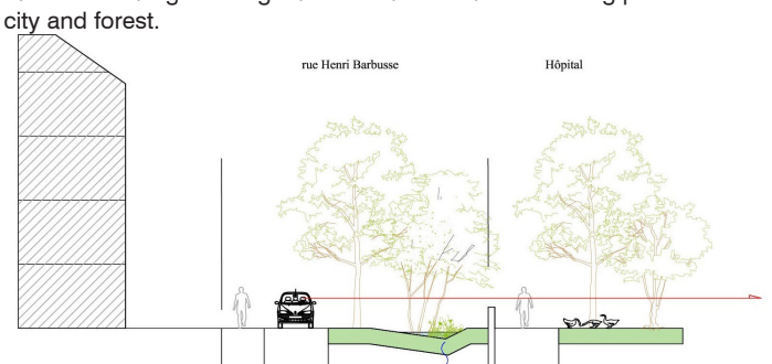
Henri Barbusse street

ping with these territorial orientations. The strong ideas of the project are to create an interconnection of the "Tégéval" and the "câble A téléval" to RER A preparing a green way and to descent the forest massif in the historic center, passing by the green lane. This wooded path will enable to take the visitor along the alive work composed of natural elements such as water and vegetation. The blue frame composing by water is one of the components of the site permitting to constitute a playful patrimony and animating nature in city through the creation of water paths or fountains where water will be captured for a moment and be back to its natural network. As well, the ambition is to establish a life area equipped with facilities creating meetings and interactions at the meeting point between city and forest