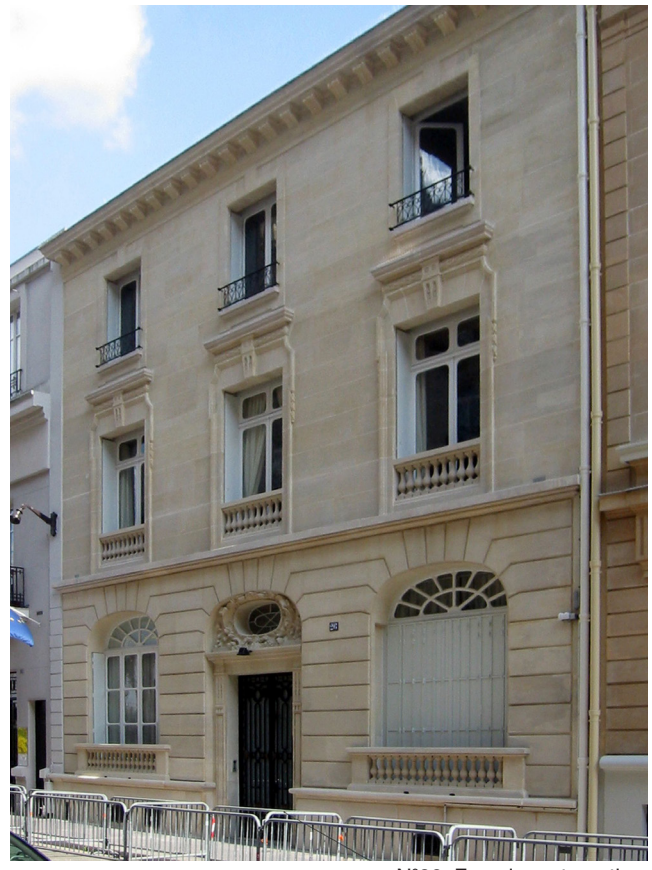
N°26, Facade restauration

Call for tender Design + Construction Surface: 600 m<sup>2</sup> Building costs BT: 400 kE Const. time: 6 months Completion: 2006 Client: German Embassy