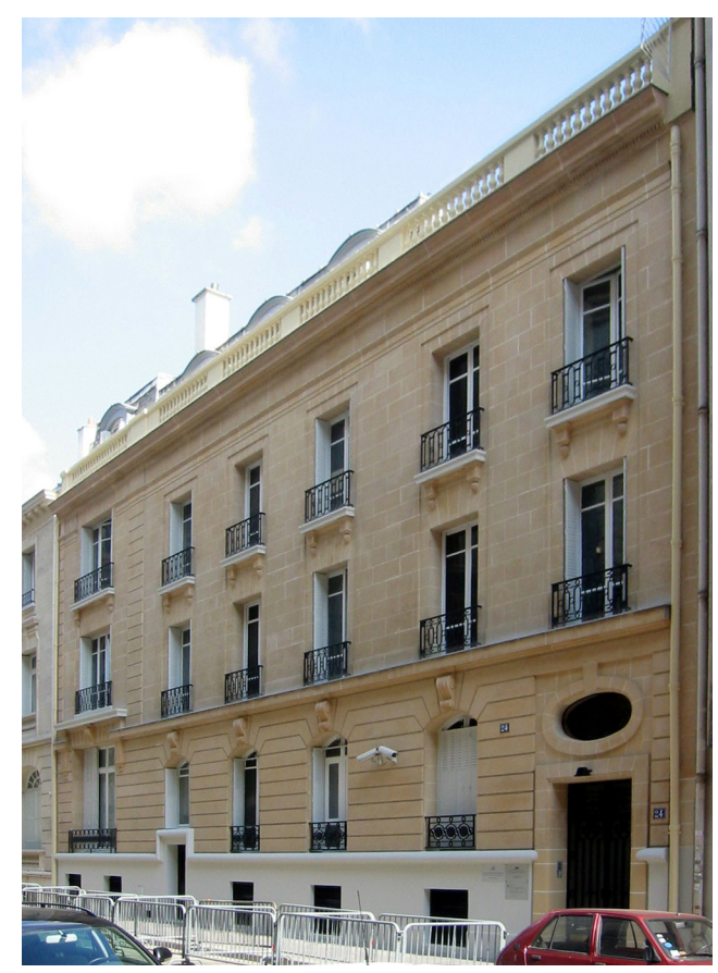
N°24, Facade restauration