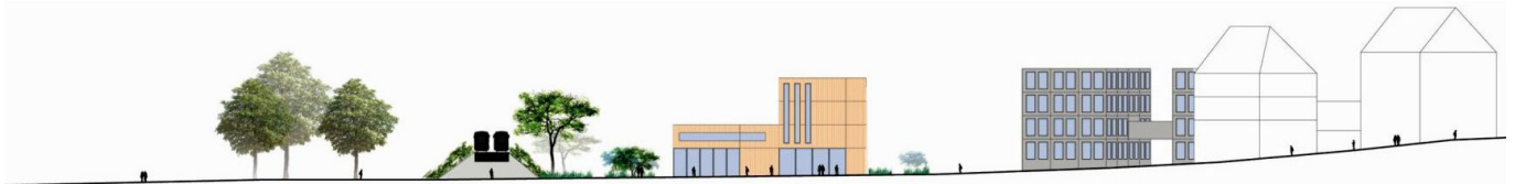
Section of the main entrance