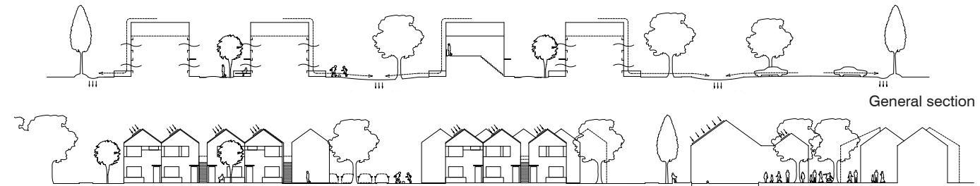
Facades of the housing units